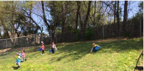
The children at Early Head Start 1 enjoyed an Easter egg hunt!